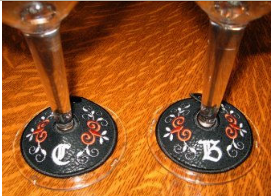
Finished glass tags!

8. Trim tag from stabilizer being careful to avoid cutting into the satin stitches. Rub warm wet rag on edge to dissolve any remaining stabilizer. Install button snap as shown above.